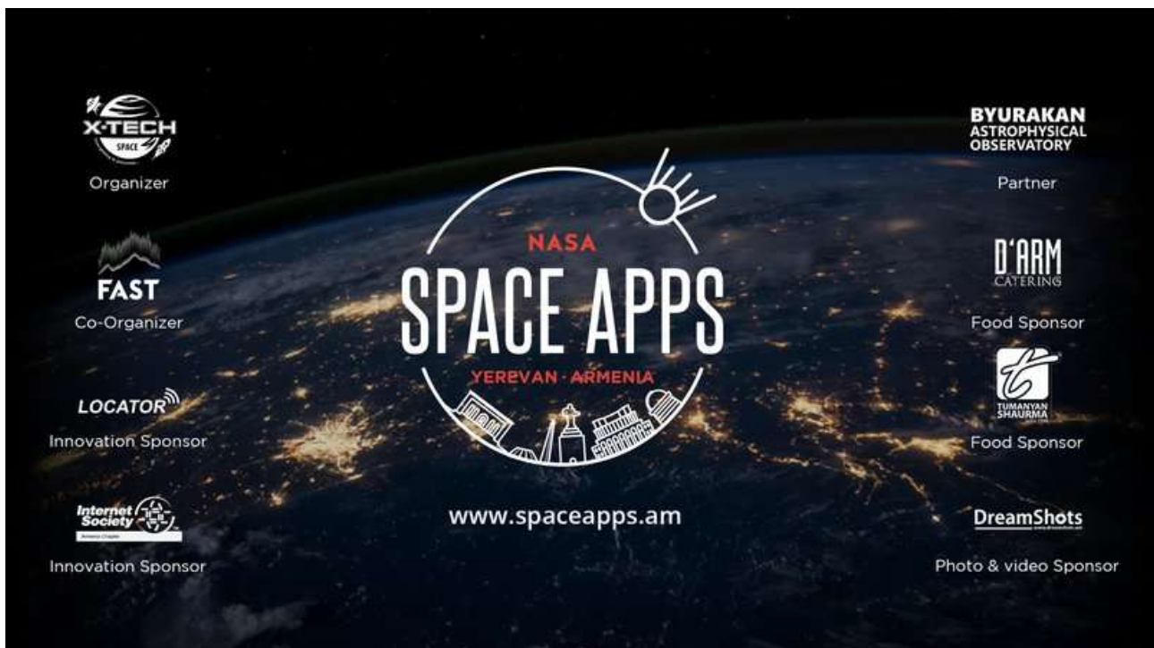
NASA Space Apps Hackathons in Armenia