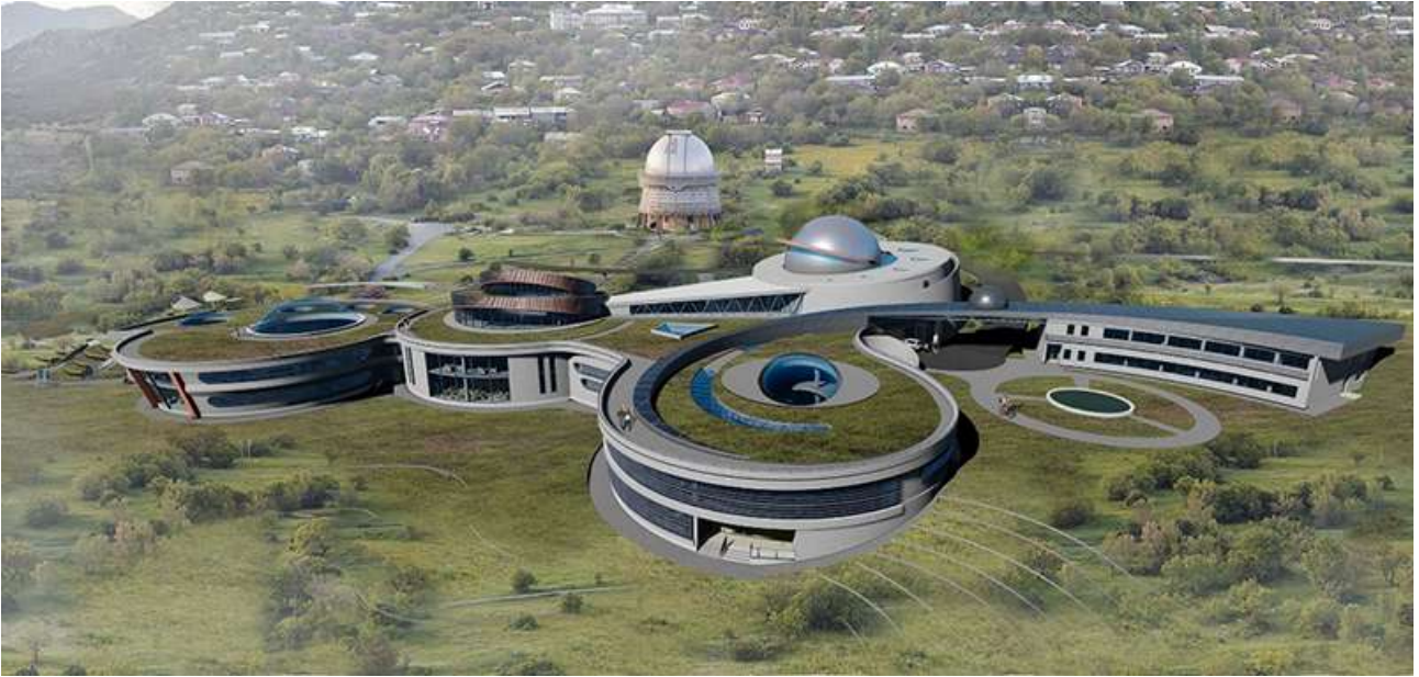
Byurakan Center for Space Technology Research and Development