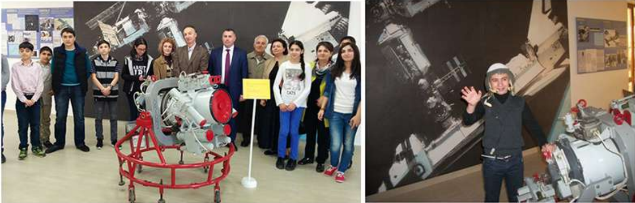
The Space Museum in Yerevan, Armenia