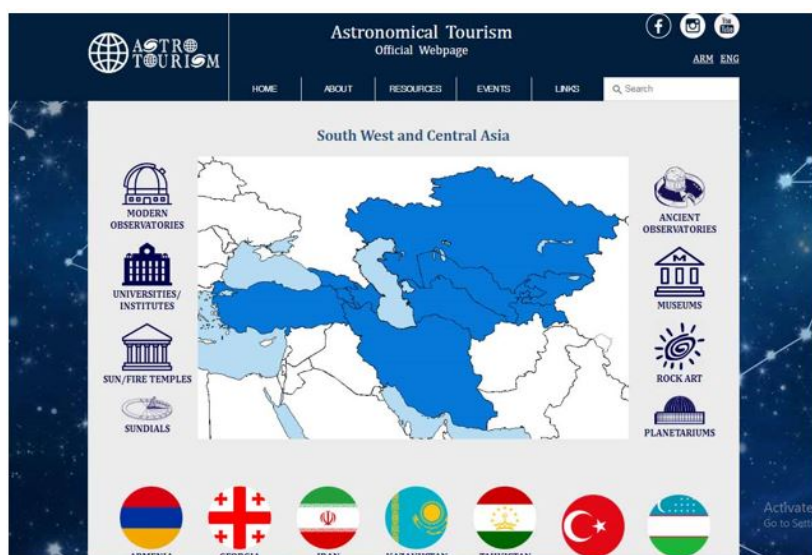
Figure 2. The main page of the project Astro Tourism in SWCA.

A film about Scientific Tourism sites in Armenia was screened. This was the result of our visits and cognitive tours to all these sites and collection of all possible information from the Internet and elsewhere, taking many photos.