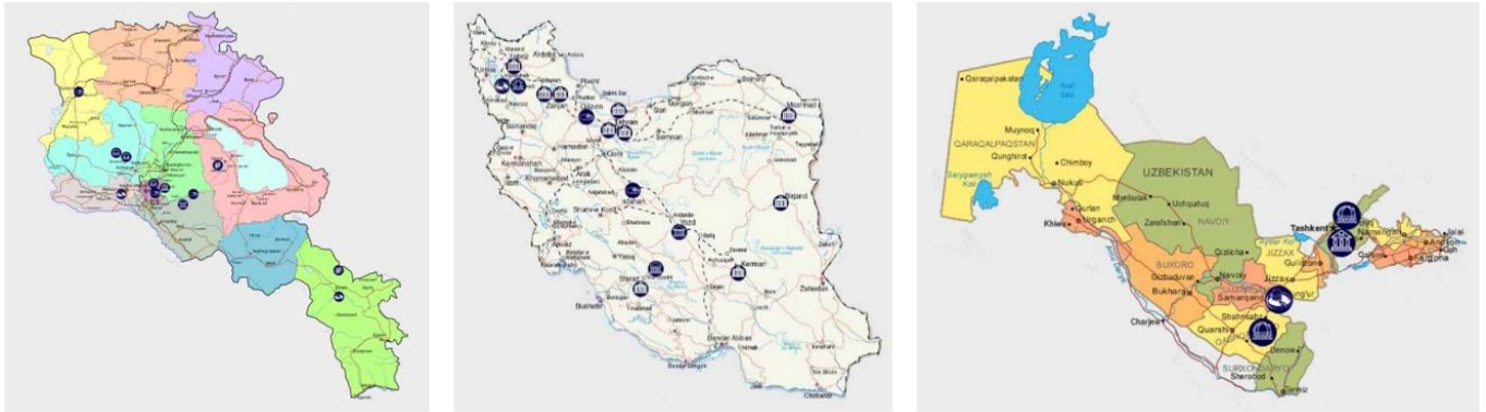
Figure 3. Armenia, Iran and Uzbekistan maps from the project Astro Tourism in SWCA with Astro Tourism sites.