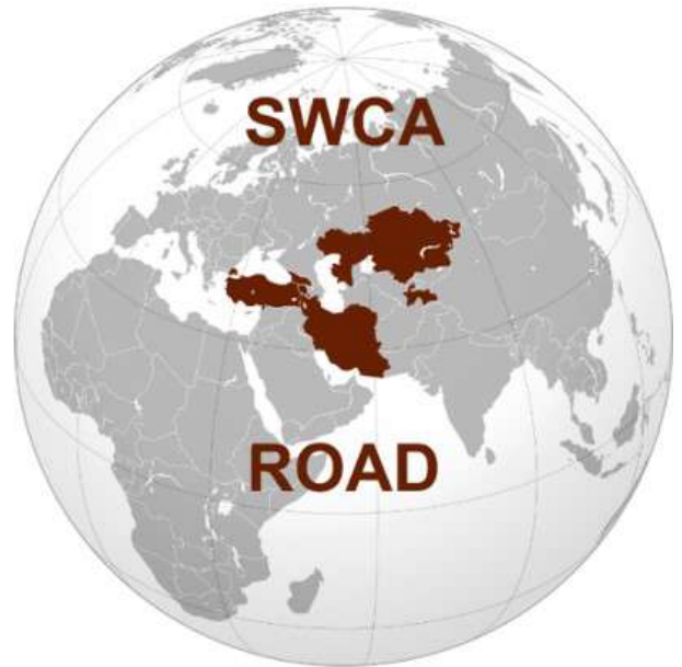
Figure 2. IAU South West and Central Asian ROAD webpage and logo showing also the geographical location of the SWCA region and 6 countries.

Astronomy in Georgia is generally represented in Abastumani Astrophysical Observatory (AbAO) founded in 1932. It is one of the leading scientific institutes in the country. Main fields of research are Solar System bodies (including near-Earth asteroids), various aspects of Solar physics, stellar astronomy (including binary stars and open clusters), extragalactic objects (AGNs), theoretical astrophysics, cosmology, atmospheric and Solar-terrestrial physics. Although research in these fields are carried out in other institutions in Georgia as well: Institute of Theoretical Physics at Ilia State Univ., Javakhishvili Tbilisi State Univ., School of Physics at Free Univ. of Tbilisi. In AbAO, several telescopes are operational today: 70cm Maksutov meniscus telescope, 53cm azimuthal reflector, 22cm reflector ORI, 40cm double astrograph, 53cm large and 11.5cm small solar coronagraphs. Spectroscopic and photometric observations are carried out. In 2007 the Observatory was integrated with Ilia State Univ., merging scientific research and education which facilitated the growth of a new generation of researchers.