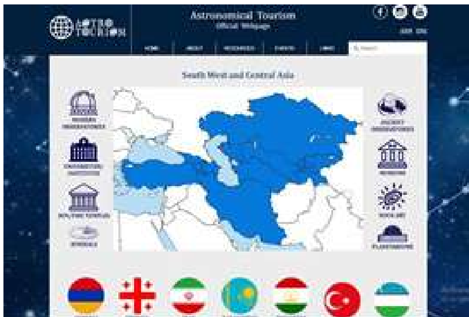
Figure 3. IAU South West and Central Asian ROAD project on Astrotourism in SWCA region.

Several projects on Scientific or Astro Tourism have been accomplished, the most important, Astro Tourism in SWCA region. Being the pioneer of Scientific (and Astronomical) tourism, IAU SWCA ROAD has initiated the creation of an astronomical tourism webpage for the region. The IAU South West and Central Asian Regional Office of Astronomy for Development implements international astronomical project focused on the region. Within the framework of the above-mentioned project “Astro Tourism” webpage has been created, which aims to introduce places of certain astronomical value that present interest for the astronomical tourism. Here you can learn about the history of astronomy and its development not only in Armenia but also in other countries of the region. The webpage also provides information on modern and ancient observatories, sundials, planetariums, space related museums and many more.