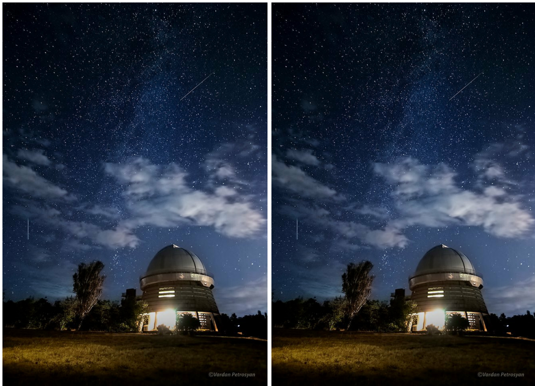
Figure 2. Now two panels.