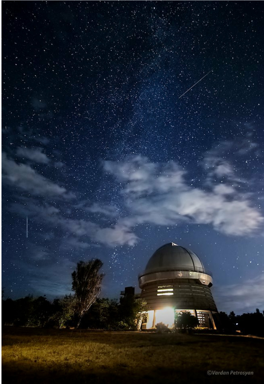
Figure 1. 2.6 m telescope of BAO.