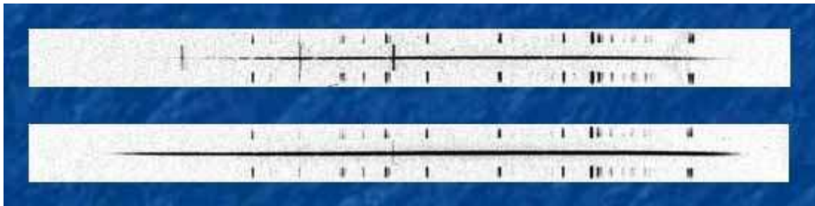
Figure 3. Standard format of FBS spectra with 650 \times 21 pix sizes images for automatic reduction.

stars; Gigoyan & Mickaelian (2012) ). All spectra were put in a standard format, so that automatic reduction was possible (Figure 3). 101 FBS blue stellar objects were published and a number of planetary nebulae, white dwarfs, hot subdwarfs and HBB stars have been revealed ( Sinamyan & Mickaelian, 2009 ).