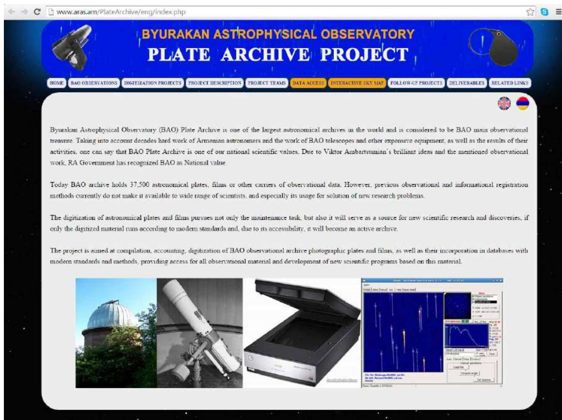
Figure 2. BAO Plate Archive Project webpage.

stars; Gigoyan & Mickaelian (2012) ). All spectra were put in a standard format, so that automatic reduction was possible (Figure 3). 101 FBS blue stellar objects were published and a number of planetary nebulae, white dwarfs, hot subdwarfs and HBB stars have been revealed ( Sinamyan & Mickaelian, 2009 ).