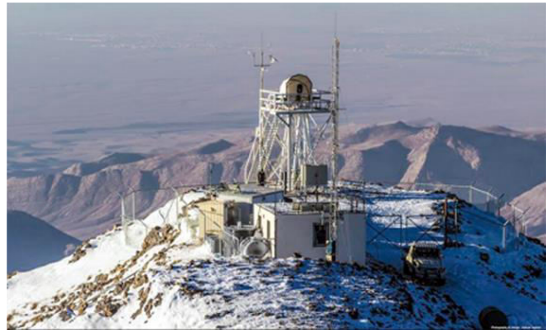
Figure 4. Iranian National Observatory (INO) at Gargash summit.

Iranian teams do very well, see a participation of a few thousand students in a national exam. The Iranian National Observatory (INO, Figure 4) is under construction at an altitude of 3600m at Gargash summit 300km southern Tehran. The site selection was concluded in 2007 and the site monitoring activities have begun since then, which indicates high quality of the site with a median seeing of 0.7 arcsec through the year. One of the major observing facilities of the observatory is a 3.4m Alt-Azimuthal Ritchey-Chretien optical telescope which is currently under design. This f/11 telescope will be equipped with high resolution medium-wide field imaging cameras as well as medium and high-resolution spectrographs.