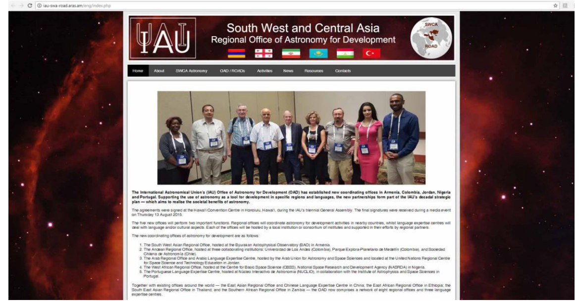
Figure 2. IAU South West and Central Asian ROAD webpage.

Like our long tradition to organize joint Armenian-Georgian (Byurakan-Abastumani) workshops (colloquia) since 1974, we conducted a new series of Armenian-Iranian Astronomical Workshops (AIAW). The first one was organized on 13-16 October, 2015 in Byurakan, so that all Iranian guests were able to participate in the IAU SWA ROAD Inauguration Ceremony.