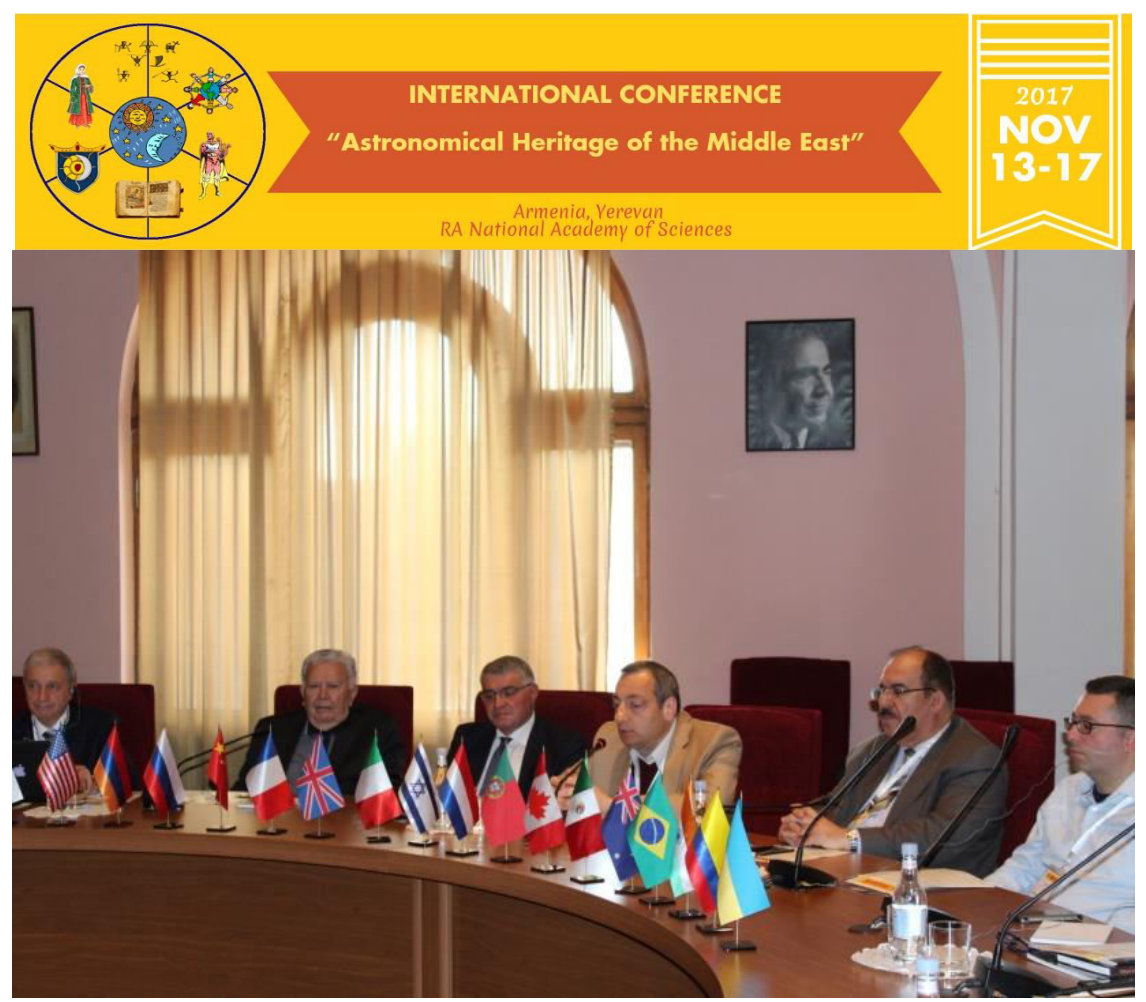
Figure 7. The International Conference "Astronomical Heritage of the Middle East".

(Honolulu, Hawaii, USA, 2015), EWASS-2016 (Athens, Greece), EWASS-2017 (Prague, Czech Rep.) Armenia-Brandenburg Workshop (Nor Amberd, Armenia, 2017), MEARIM-IV (Addis Ababa, Ethiopia, 2017), etc.