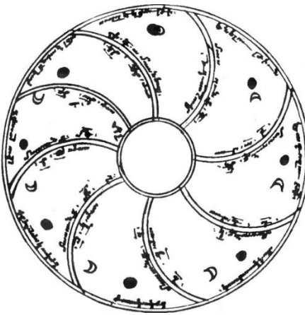
Figure 2. Phases of the Moon

In the chapter of the "About Moon" Shirakatsi mentions that the Moon is a thick, hard and spherical body that does not have its own light and is illuminated by the sunlight. Shirakatsi also mentions the occurrence of the Moon's sphases. According to him, the Moon does not always have the same shape, once it grows, once it becomes thick one, while they are in the same direction during the circle, at that time the Sun illuminates the upper part of the Moon, and the bottom remains mysterious. Then the Moon leaves the Sun and we see its lighted part. In this chapter, Shirakatsi also interprets the eclipses of the Sun and the Moon. He writes that the Moon is the cause of the solar eclipse, as the Sun, covers the light coming to us. Shirakatsi also thinks that sea fluxes and refinements are also tied to Lunar phases. The Shirakatsi conceptions about the Moon and its influence essentially coincide with modern ideas.