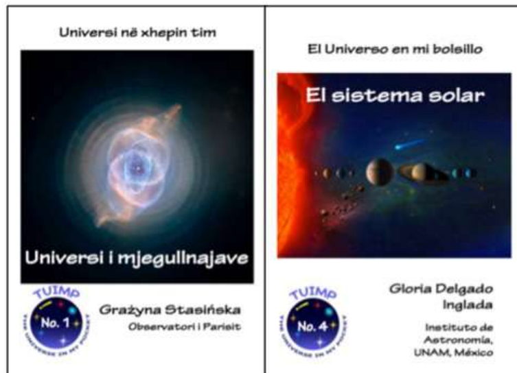
Figure 3. The covers of two booklets, one in Albanese, the other in Spanish.

Ready-made outreach internet sites are numerous in English but are likely scarce in the majority of languages, except a few in which an active astronomical community is working.