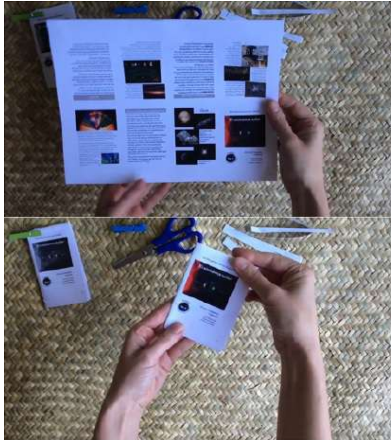
Figure 1. How to fold a booklet.